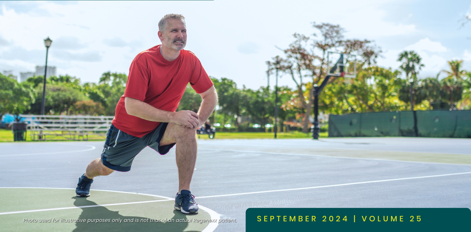
Photo used for illustrative purposes only and is not that of an actual Regenexx patient.