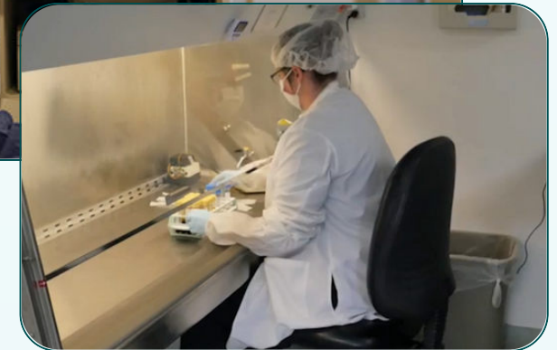
Lab Processing – Custom Cell Concentrations

The ultimate goal: To improve mobility and quality of life with less downtime.